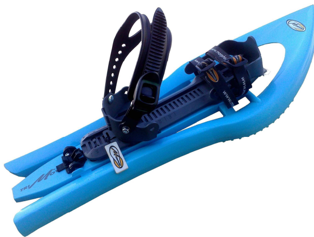
REF. 13MHRAQ3L Fig. 1

TRIMOVE LIGHT© Snowshoe People between 60 and 96kgs, UNISEX FLAT TERRAINS, FREERIDE, POWDER www.morpho.tm.fr