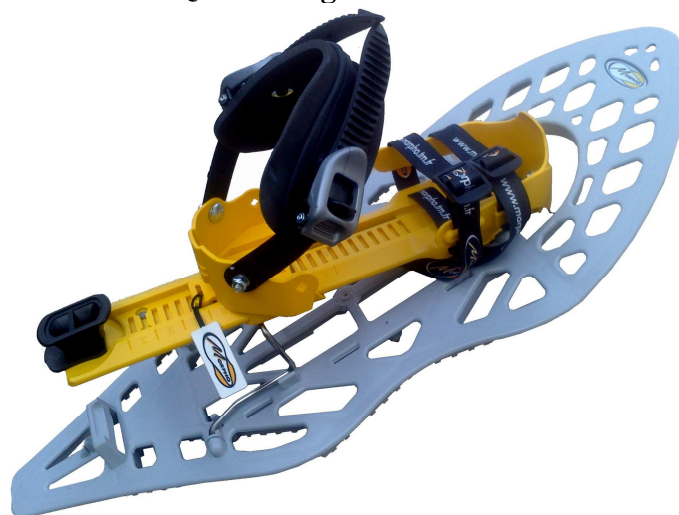
REF. 13MHRAQVDA Fig. 1

SUPERMORPHOALP Snowshoe People between 60 and 96 kgs, UNISEX ALPINE SLOPES, ALL TERRAINS, RENTAL www.morpho.tm.fr