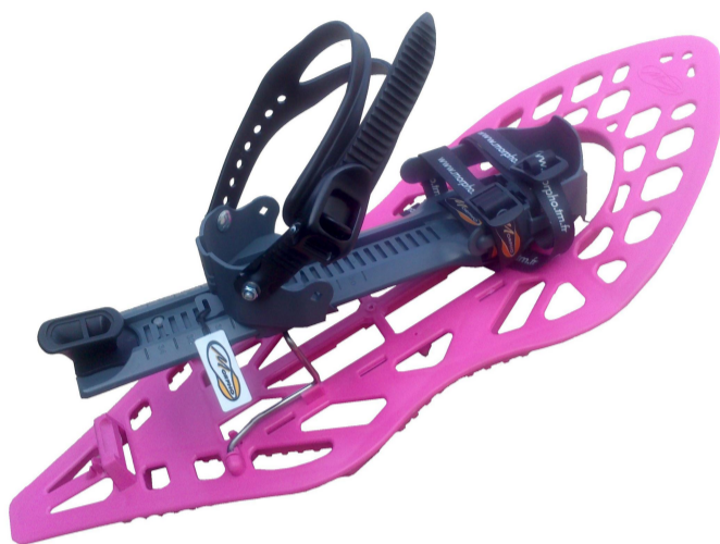
REF. 13MHRAQVLA Fig. 1

MORPHOALP LIGHT Snowshoe People between 60 and 96 kgs, UNISEX ALPINE SLOPES, ALL TERRAINS www.morpho.tm.fr