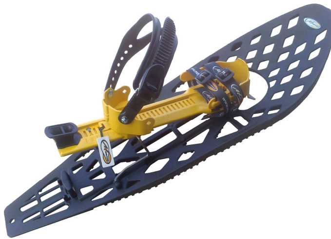
REF. 13MHRAQTLA Fig. 1

TRIMALP LIGHT© Snowshoe People between 90 and 150kgs, MEN ALPINE SLOPES, FREERIDE, EXTREME POWDER www.morpho.tm.fr