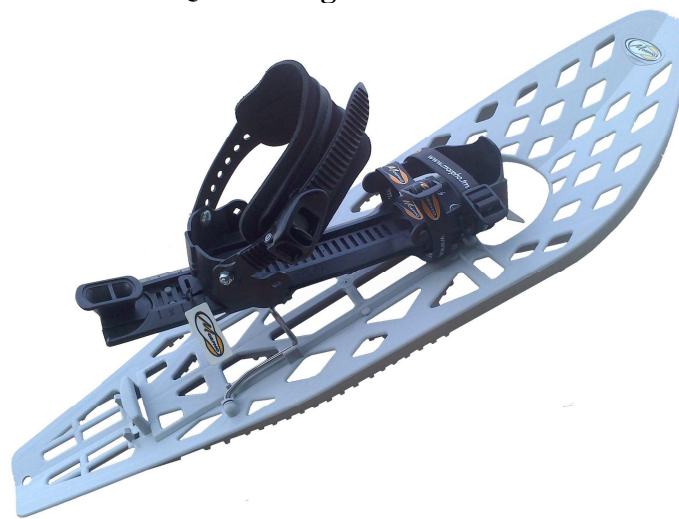
REF. 13MHRAQTSA Fig. 1

TRIMALP© Snowshoe People between 90 and 150kgs, MEN ALPINE SLOPES, FREERIDE, EXTREME POWDER www.morpho.tm.fr