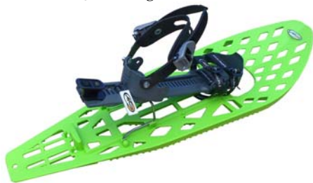
REF. 13MHRAQTDLA Fig. 1

SUPERTRIMALP LIGHT© Snowshoe People between 90 and 150kgs, MEN ALPINE SLOPES, FREERIDE, POWDER, RENTAL www.morpho.tm.fr