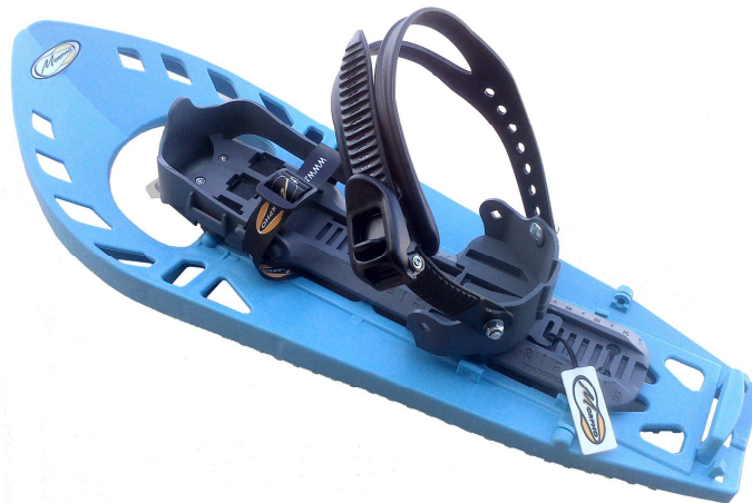
REF. 13MHRAQYLEC Fig. 1

TRIMMYETTE LIGHT© Snowshoe People weight up to 64kgs, UNISEX and KIDS FLAT TERRAINS, TRAIL www.morpho.tm.fr