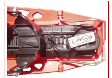
Fig.2 Size adjust lever Logo rubber tab puller