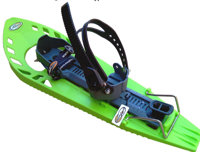
REF. 13MHRAQOLA Fig. 1

TRIMOALP LIGHT© Snowshoe People between 60 and 96 kgs, UNISEX ALPINE SLOPES, ALL TERRAINS www.morpho.tm.fr