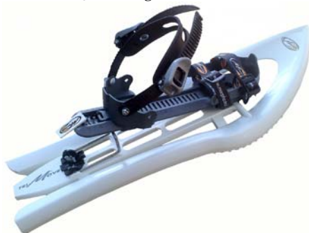
REF. 13MHRAQ3DLA Fig. 1