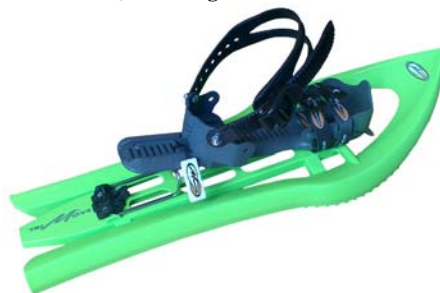
REF. 13MHRAQ3LA Fig. 1

TRIMOV'ALP LIGHT© Snowshoe People between 60 and 96kgs, UNISEX ALPINE SLOPES, FREERIDE, POWDER www.morpho.tm.fr