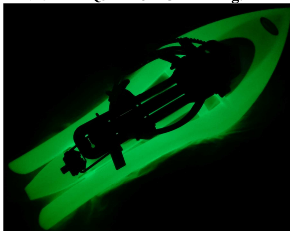
REF. 15MHRAQ3LA LUM GB Fig. 1

LUMIO'ALP LIGHT© Snowshoe M People between 60 and 96kgs, UNISEX NIGHT TRECKS, ALPINE SLOPES, POWDER www.morpho.tm.fr