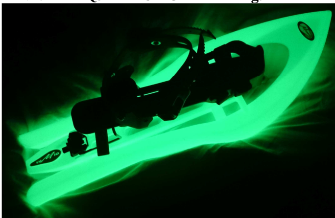
REF. 15MHRAQ3DLA LUM GB Fig. 1

SUPER LUMIO'ALP LIGHT© Snowshoe M People between 60 and 96kgs, UNISEX NIGHT TRECKS, ALPINE SLOPES, RENTAL, POWDER www.morpho.tm.fr