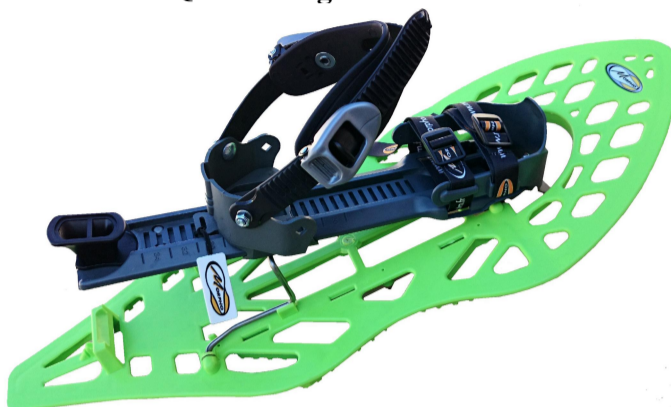
REF. 13MHRAQVDLA Fig. 1

SUPERMORPHOALP LIGHT Snowshoe People between 60 and 96 kgs, UNISEX ALPINE SLOPES, ALL TERRAINS, RENTAL www.morpho.tm.fr